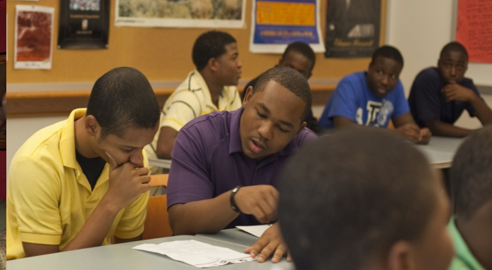
Providing Educational Opportunities to African American Students