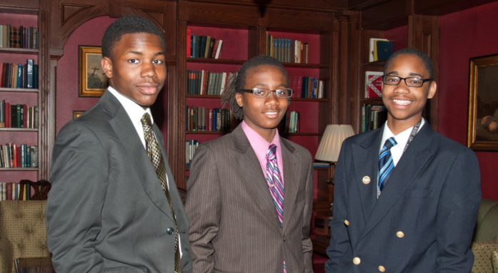
Making Diversity and Equality of Opportunity a Priority