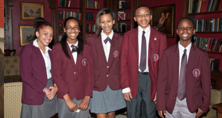
Helping Students to Reach Their Full Potential